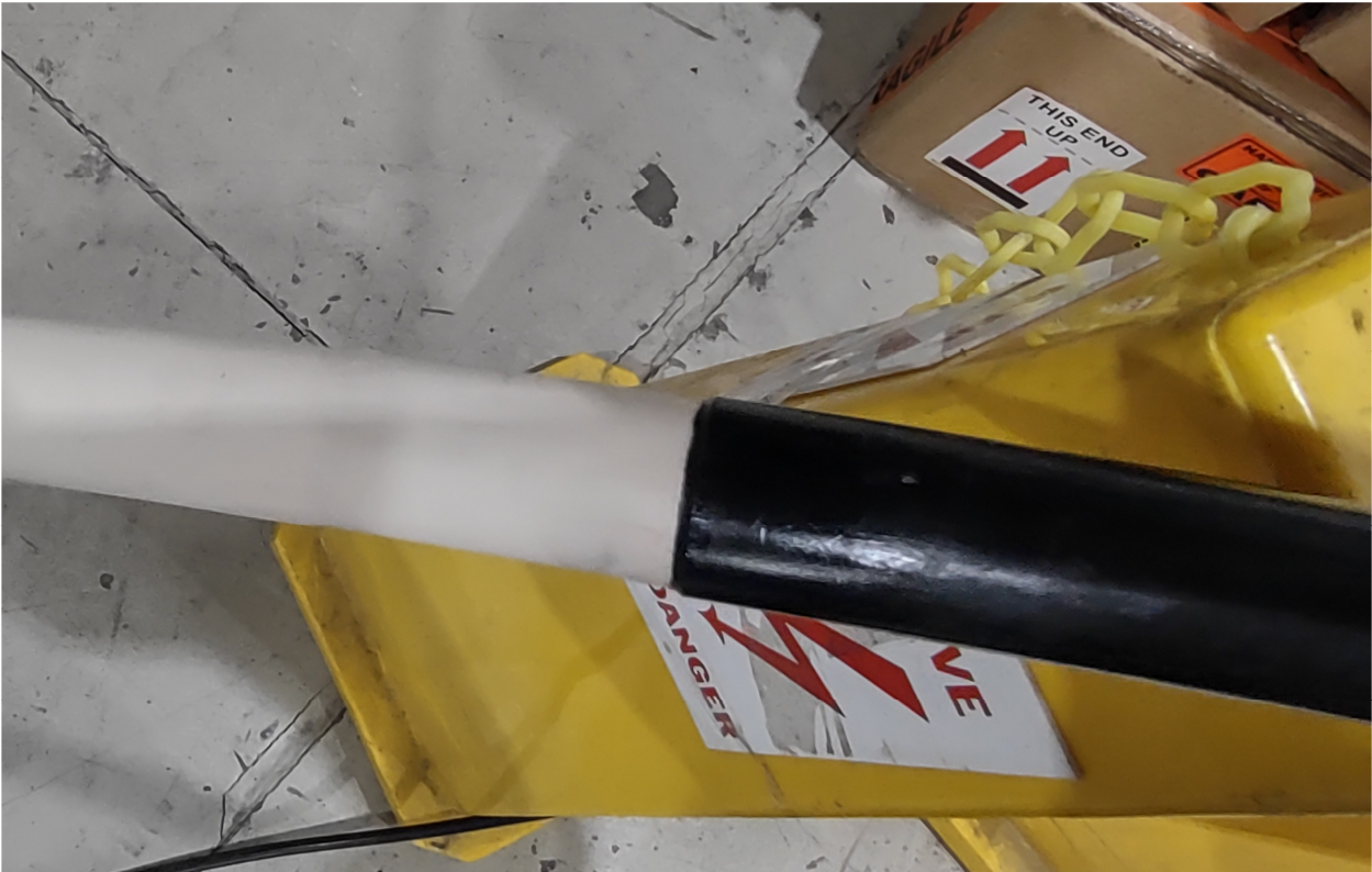
Picture 1 Cable sample, Cold Shrink Stress Relief Tube not installed